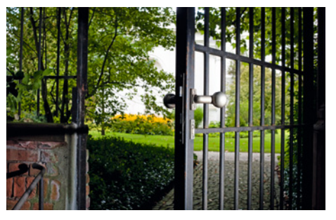
Garden gate in the park between the Villa Hammerschmidt and the Palais Schaumburg