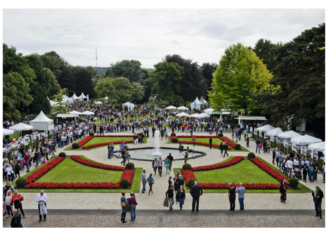
Open day at Villa Hammerschmidt, June 2018

Heuss had the Villa completely renovated, getting rid of the two towers which had dominated its external appearance. While the interior is divided up more or less as it always was, very few of the original fittings or decor remain. The building was converted and renovated several times in the years thereafter.